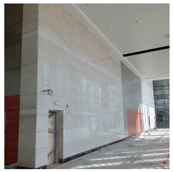
Terminal 2, Cairo Airport.