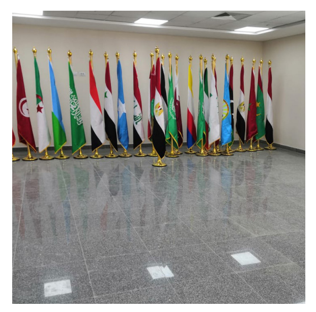
AAST Campus, New Alamein City.