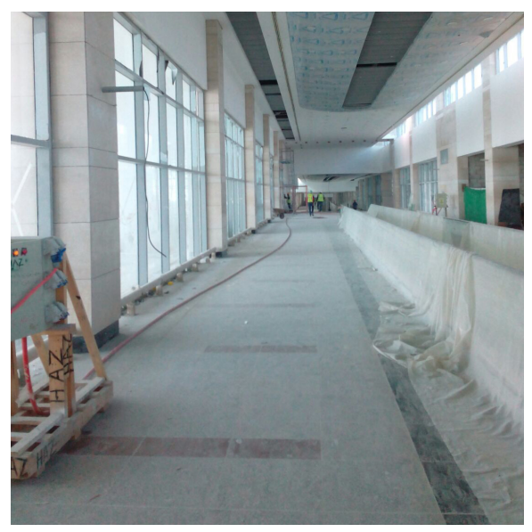
Terminal 2, Cairo Airport.