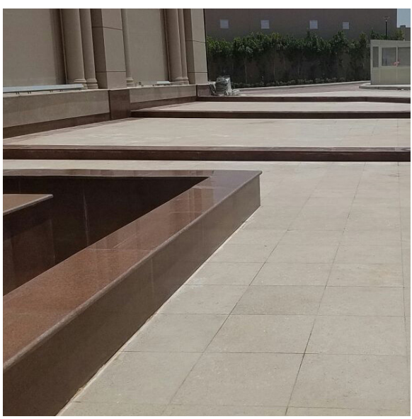
Tivoli Plaza, Cairo.