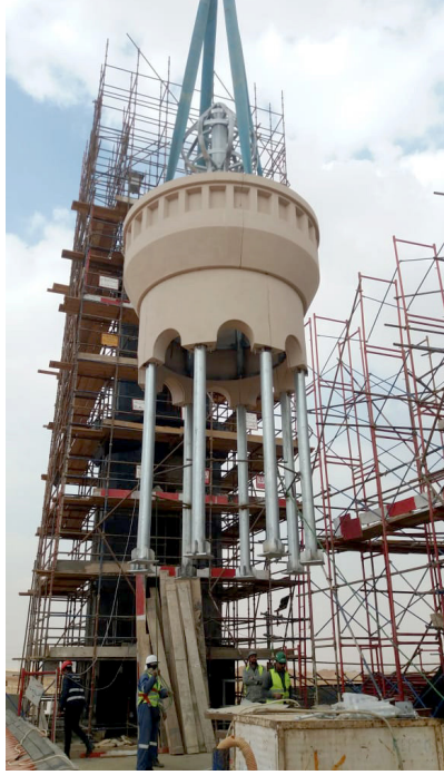
Lifting the minaret's balcony to its position from the ground.