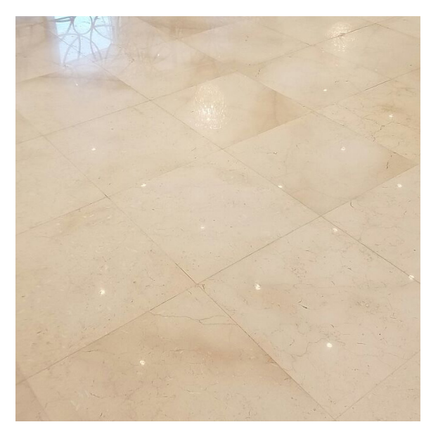
Tivoli Plaza, Cairo.